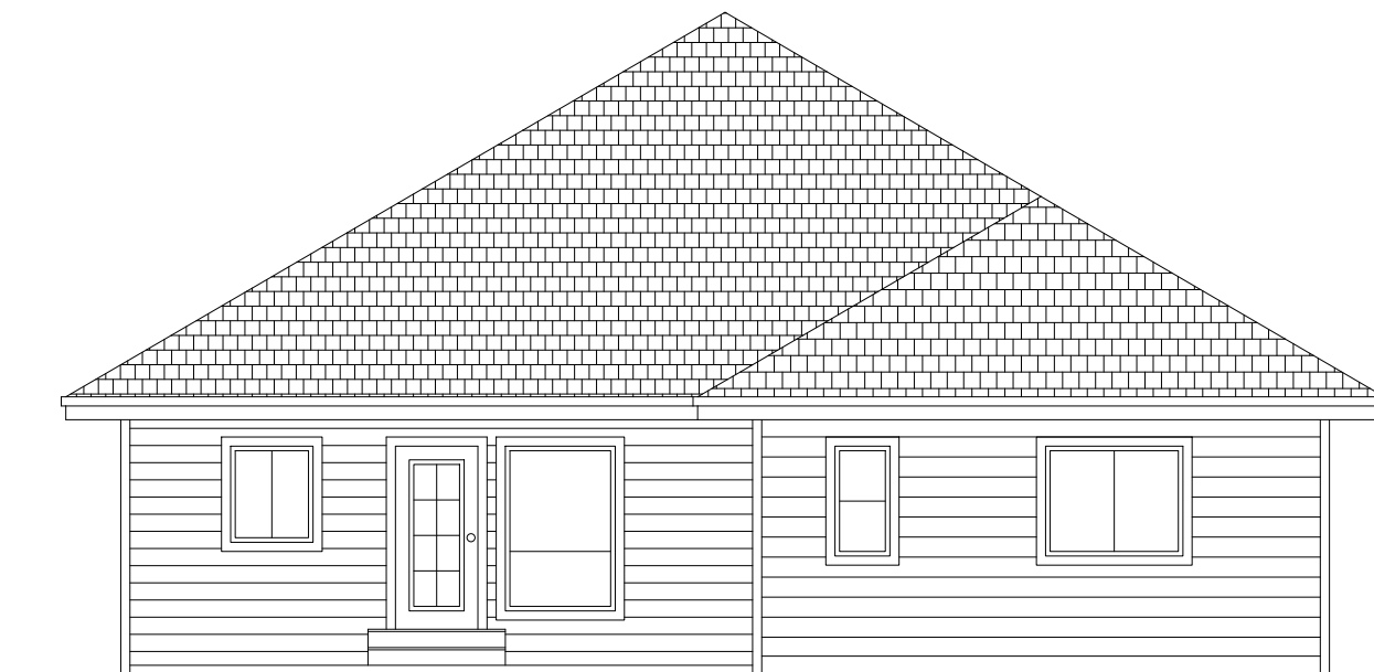
REAR ELEVATION 1/8" = 1'-0"