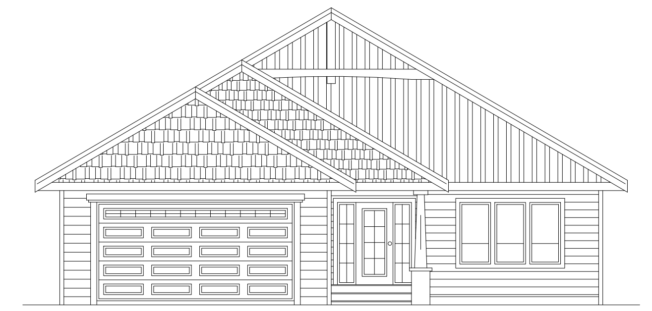
FRONT ELEVATION 1/8" = 1'-0"